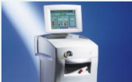
VersaPulse® PowerSuite™ Holmium and Dual Wavelength Lasers

Accessories are available for stripping, cleaving, and sterilizing the reusable SlimLine Fibers.