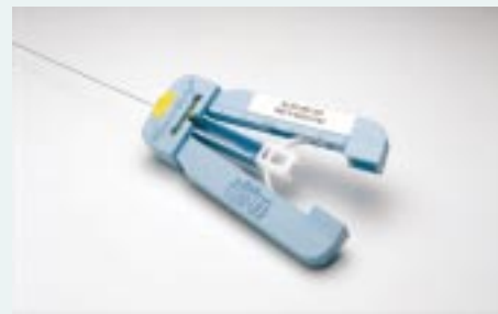
Fiber Stripper Removes outer jacket from distal end of fibers