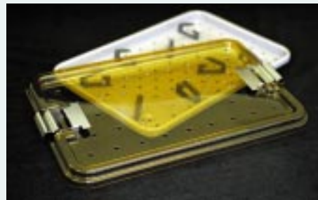
Sterilization Tray Designed for processing fibers