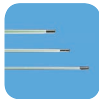
SlimLine EZ single-use fibers