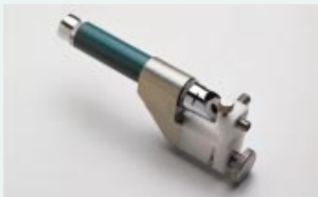
Inspection Scope Allows convenient visualization of the fiber tip and the connector