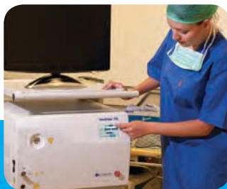
Flexible treatment settings

The VersaPulse P20 has integrated intelligent fiber identification technology. This technology enables the system to detect which Lumenis fiber has been connected and automatically brings up last settings used. These reusable and single-use fibers are custom designed to work seamlessly with the VersaPulse family and are perfectly suited for procedures such as tumors and stones.