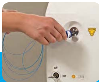
Intelligent fiber identification technology