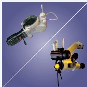
ClearSpot™ 350 / AcuSpot™ 712 Large Spot, Small Spot Micromanipulators