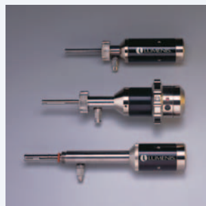
Laparoscopic Couplers Laparoscopic Surgery