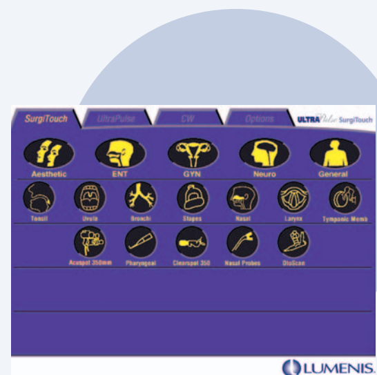
UltraPulse SurgiTouch User-friendly Touch Screen Control Panel

The UltraPulse SurgiTouch scans a highly focused laser beam rapidly over a pre-determined spot size (potentially up to 15mm), eliminating conduction of heat to adjacent tissue. It incorporates the most advanced technologies in CO 2 laser surgery today: the 60 Watt char-free pulse energy with the SurgiTouch user interface and scanner system.