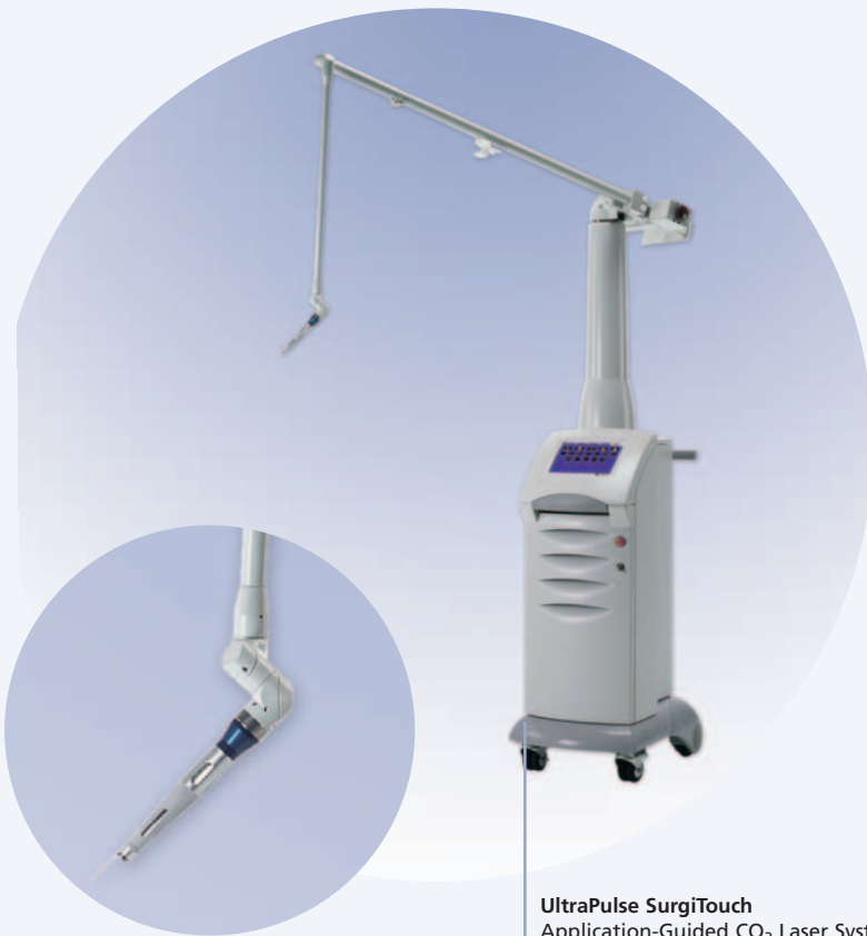
UltraPulse SurgiTouch Application-Guided CO 2 Laser System