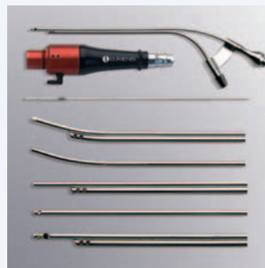
Oral/ENT FiberLase™ Delivery System Flexible CO 2 Fibers